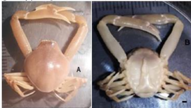
Fig. 2 - Hiplyra elegans (Gravier, 1920). A, B, ♂; C, D, ♀. Scales: 1mm.

1♂, CL. 16.00 mm, CB.15.40 mm; 1♀ CL. 18.0 mm, CB. 16.80mm in deep 6-12 m (MSC).