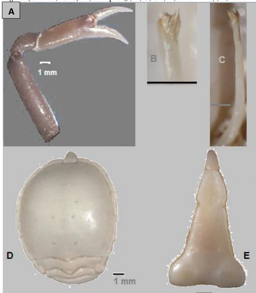
Fig. 3 - Hiplyra elegans (Gravier, 1920). A, cheliped ♂; B, C, G1; D, abdomen ♀; E, abdomen ♂. Scales: 1mm.

lower margin of the first and the second pereopod bear granules lines. Pereiopods are slender and short. G1 widened distally, with small subdistally apical process and the 1 st somite of female abdomen not lobate (Fig. 2. B).